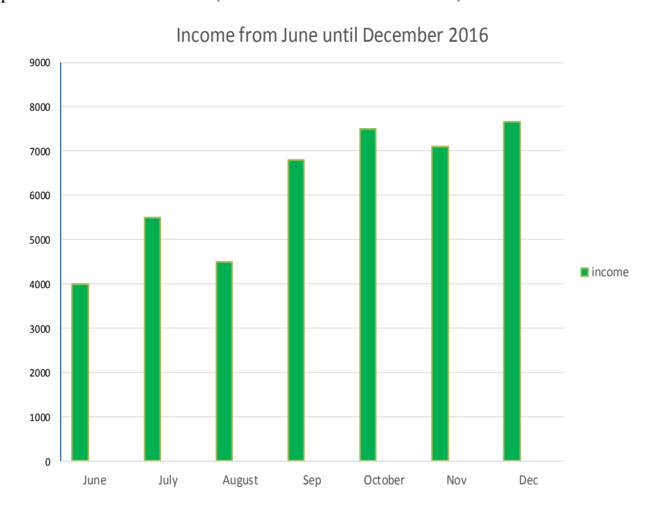
Figure 1. Graph Income after Six Months (from June until December 2016)

The graph below shows income after 6 months of starting business